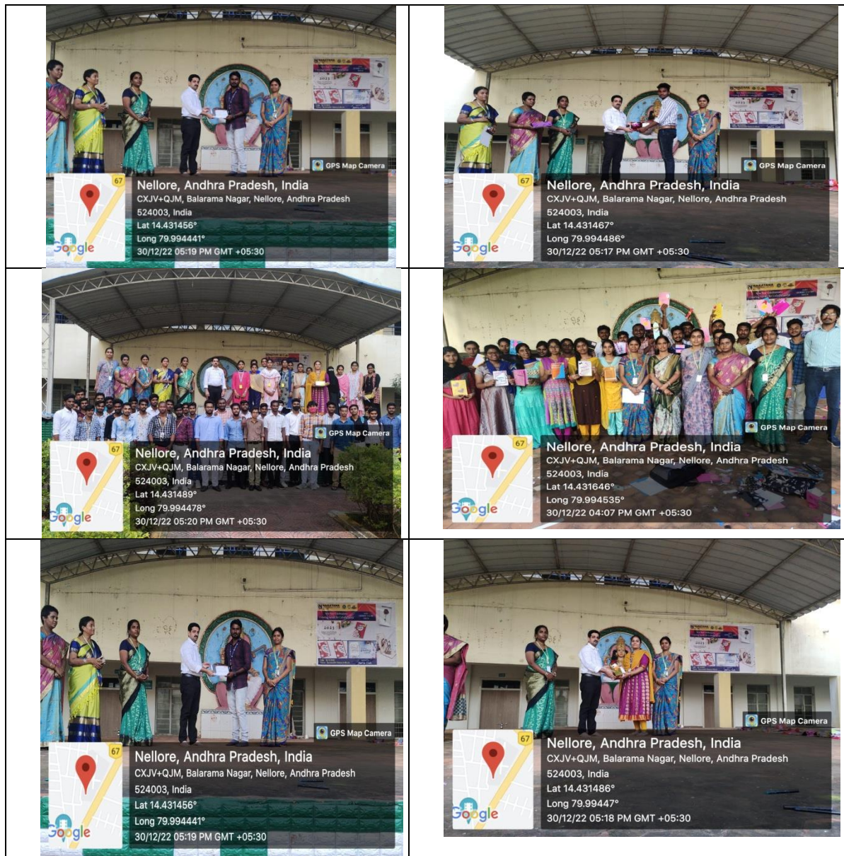
New year greeting card winners and participating students gathering